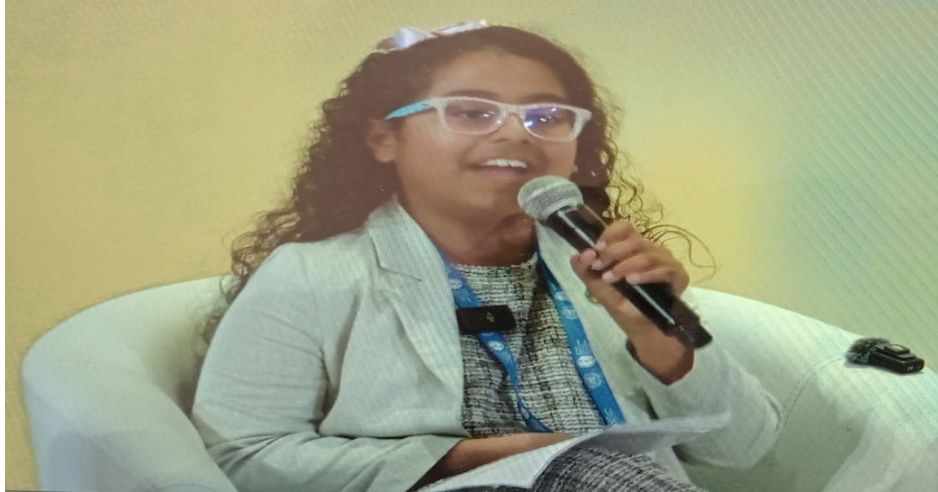
Nine-year-old at the Second World Social Summit for Development advocates for those excluded by the existing systemic structures.