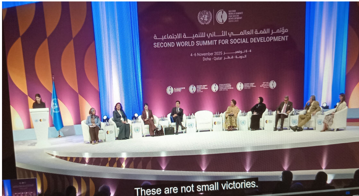
Civil Society Forum during Second Social Summit for development. Panelist presentation on Various issues