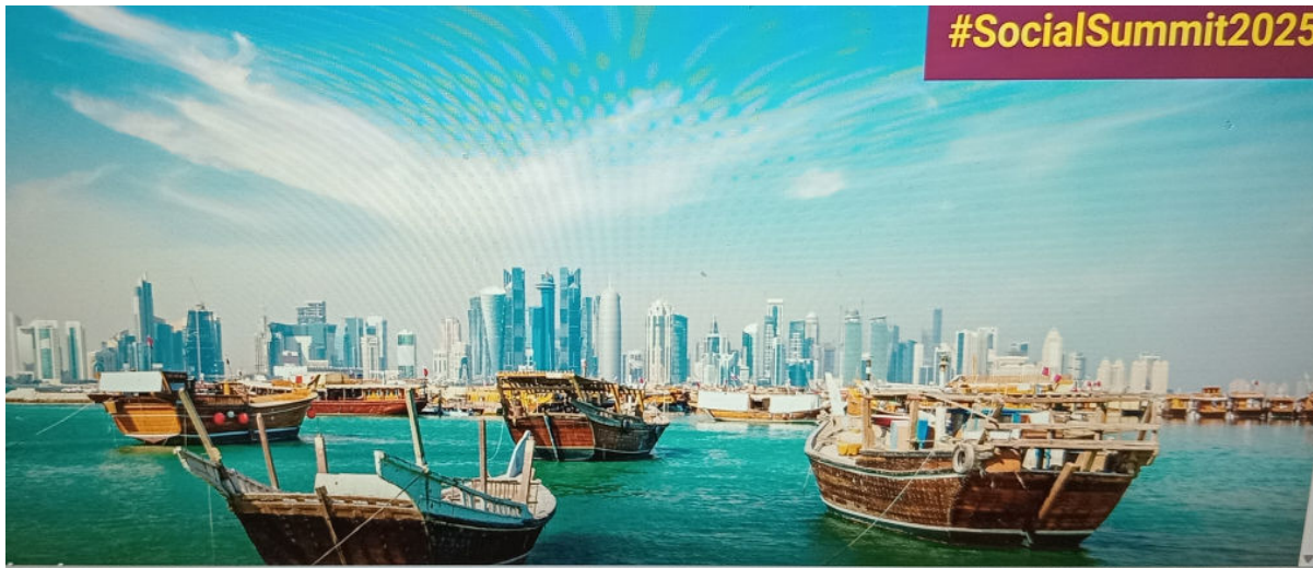
Arrival and reception of VIP for the Second World summit for Development in Doha, Qatar

The Second World Summit for Social Development convened in Doha, Qatar, from November 4–6, 2025—marking three decades since the historic Copenhagen gathering. The world leaders came together to redefine strategies for social progress, strengthen global partnership, and promote inclusive policies that foster equitable opportunities for all. Over 14,000 people attended the summit.