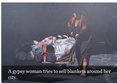
A gypsy woman tries to sell blankets around her city.

Each of us can learn something from others. This also means finding ways to include those on the peripheries of life. For they have another way of looking at things, they see aspects of reality that are invisible to the center of power. (FT 215)