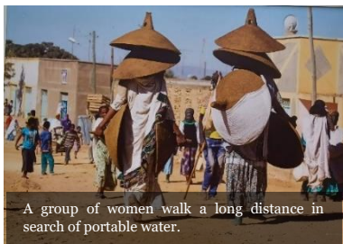
A group of women walk a long distance in search of portable water.

Each of us is called to be an artisan of peace, by uniting and not dividing, by extinguishing hatred and not holding on to it, opening paths of dialogue and not by constructing new walls. (FT 284)