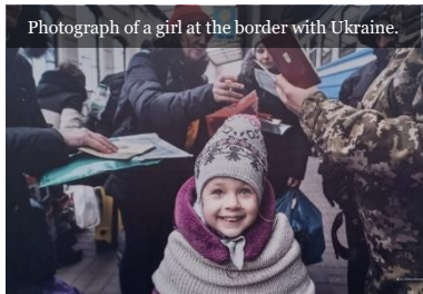
Photograph of a girl at the border with Ukraine.

To value the richness and beauty of those seeds of common life that need to be sought out and cultivated. (FT31)