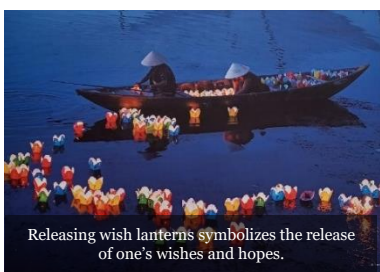
Releasing wish lanterns symbolizes the release of one's wishes and hopes.

Creating in countries of origin the conditions needed for a dignified life. (FT 129)