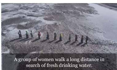
A group of women walk a long distance in search of fresh drinking water.

Let us dream as a single human family, each of us bringing the richness of his or her beliefs and convictions, each of us with his or her own voice, brothers, and sisters all. (FT8)