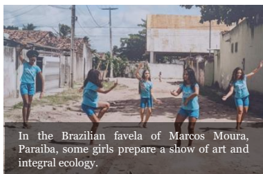
In the Brazilian favela of Marcos Moura, Paraiba, some girls prepare a show of art and integral ecology.

The first victim of every war is the human family's innate vocation to fraternity. (FT 26)