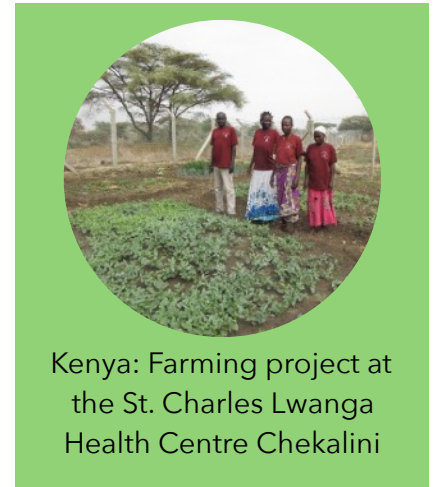
Kenya: Farming project at the St. Charles Lwanga Health Centre Chekalini