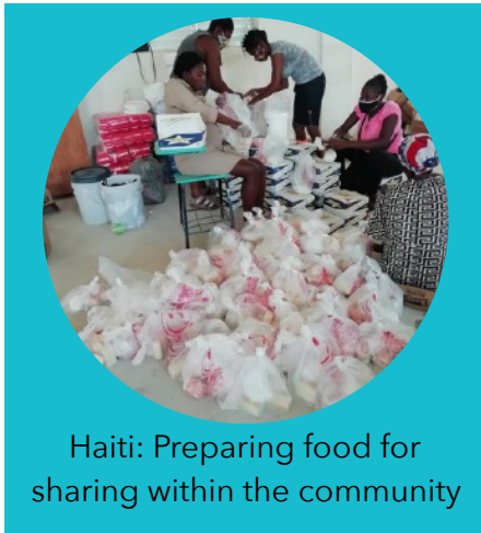
Haiti: Preparing food for sharing within the community