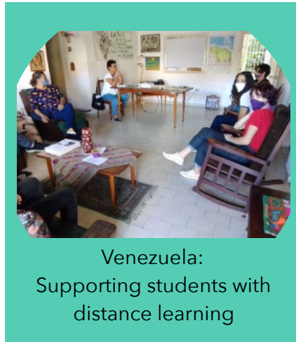
Venezuela: Supporting students with distance learning