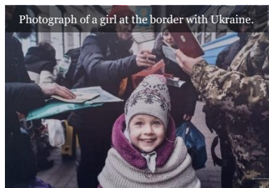
Photograph of a girl at the border with Ukraine.

To value the richness and beauty of those seeds of common life that need to be sought out and cultivated. (FT31)