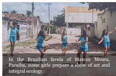
In the Brazilian favela of Marcos Moura, Paraiba, some girls prepare a show of art and integral ecology.

The first victim of every war is the human family's innate vocation to fraternity. (FT 26)