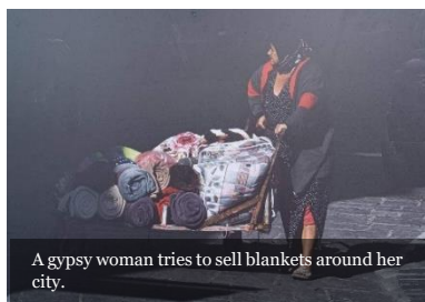
A gypsy woman tries to sell blankets around her city.

Each of us can learn something from others. This also means finding ways to include those on the peripheries of life. For they have another way of looking at things, they see aspects of reality that are invisible to the center of power. (FT 215)