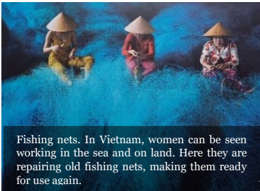
Fishing nets. In Vietnam, women can be seen working in the sea and on land. Here they are repairing old fishing nets, making them ready for use again.

Let us continue to advance along the paths of hope to open us up to grand ideals that make life more beautiful and worthy. (FT52)