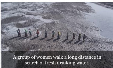
A group of women walk a long distance in search of fresh drinking water.

Let us dream as a single human family, each of us bringing the richness of his or her beliefs and convictions, each of us with his or her own voice, brothers, and sisters all. (FT8)