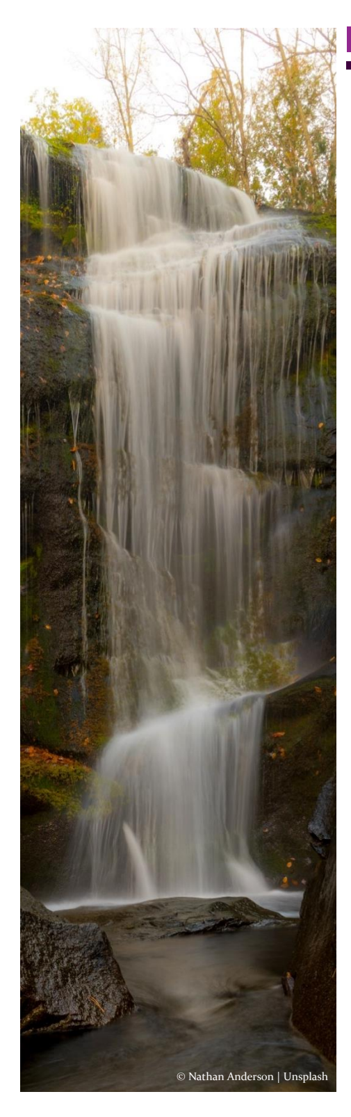
[English translation of poetry by Roy Campbell, "Poems of St John of the Cross", p.45 (Collins Fount Paperbacks, 1986)]

[La Fonte - San Juan de la Cruz | Carmelitas Misioneras]