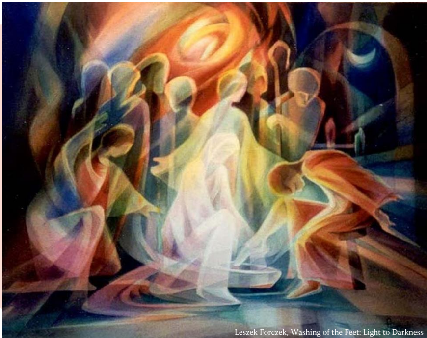
Leszek Forczek, Washing of the Feet: Light to Darkness