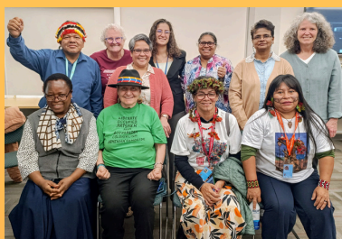
Parallel Event: Conversation between Indigenous leaders about their achievements & struggles