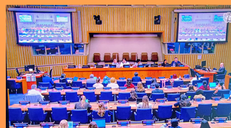
Closing ceremony of the forum

Concluding on May 2, 2025, the 24th session of the UNPFII, rich in knowledge and rooted in the reality of the indigenous people's lives, left participants inspired and firmly committed to advocacy for indigenous people's rights. The forum fostered a renewed sense of purpose and reverence for indigenous peoples' ancestral knowledge and wisdom. It elevated global understanding and appreciation for the resilience of indigenous communities.