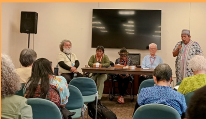
Parallel event: Conversation with Indigenous leaders about the impact of extractivism on Indigenous people.