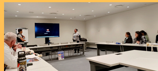
Side event: "Land Rights, Land Activation and Economic Development"