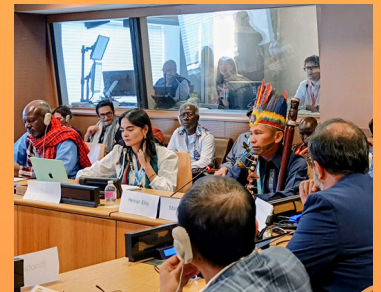
Side event about Indigenous-led protocols on Free, Prior and Informed Consent: advancing the rights to self-determination and self-government

A resounding message echoed throughout the forum: The rights and dignity of Indigenous Peoples are non-negotiable!!!!