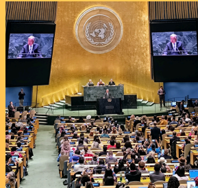
UN Secretary General, Antonio Guterres, speaking at the opening ceremony of the UNPFII

The special theme of the UNPFII was: "Implementing the United Nations Declaration on the Rights of Indigenous Peoples within United Nations Member States and the United Nations system, including identifying good practices and addressing challenges,"