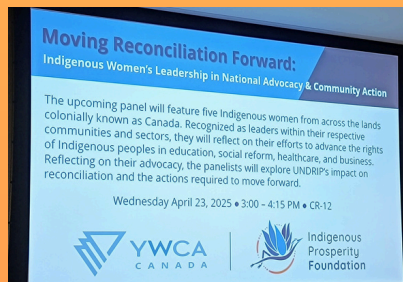
Side event about moving reconciliation forward and Indigenous women's leadership in national advocacy & community action