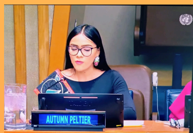
Indigenous youth leader at a global dialogue on the rights of Indigenous women

Furthermore, the presence of the Indigenous Peoples and the presentations made at the forum were inspiring for their strength and outspoken activism—particularly the active participation of Indigenous youth and the broad representation of Indigenous communities from all continents.