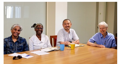
Video Meeting with UN